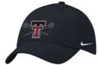
Tualatin Lax - Back